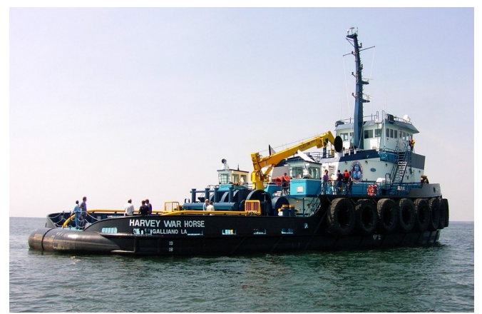
"WARHORSE" 10,000 horsepower Ocean Tug 2002