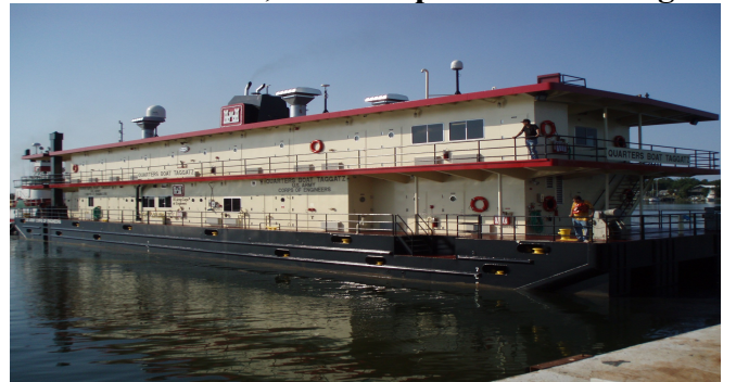
"TAGGATZ" 160' Quarters Barge 2008