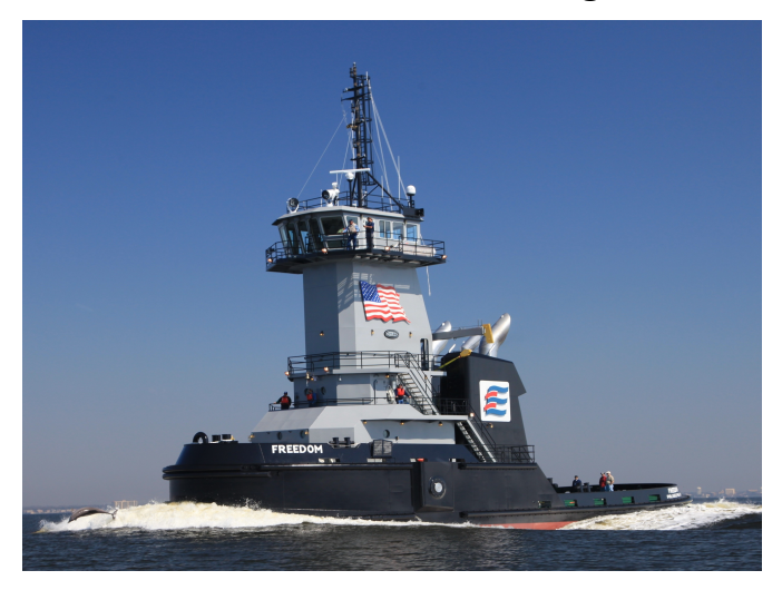
"FREEDOM" 6,000 horsepower Ocean Tug 2010