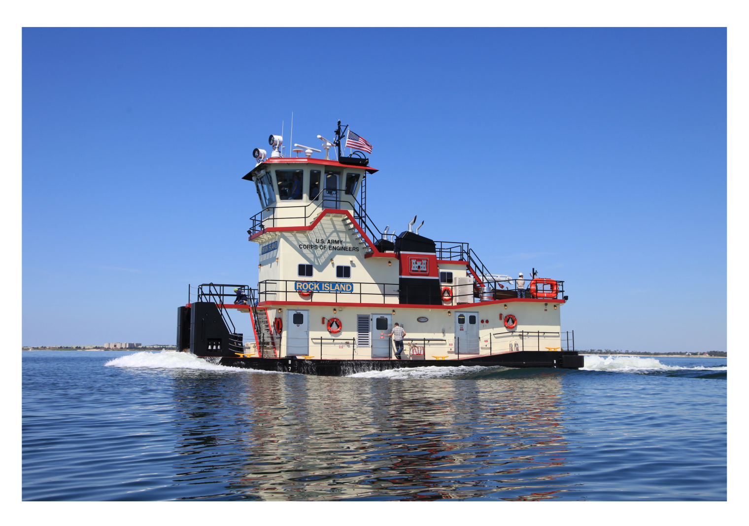
This Patti Press celebrates the launch of the "ROCK ISLAND" and the achievements of the Patti organizations.