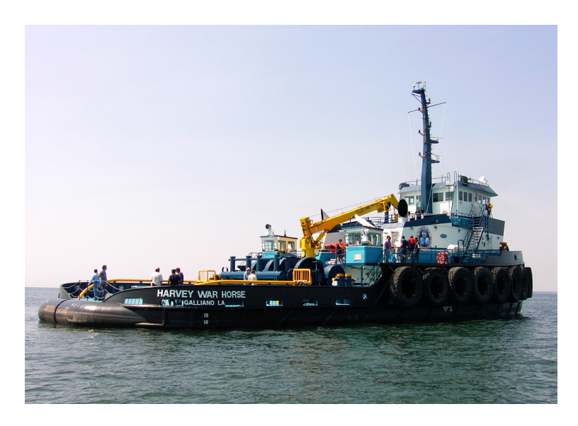
"WARHORSE" 10,000 horsepower Ocean Tug 2002