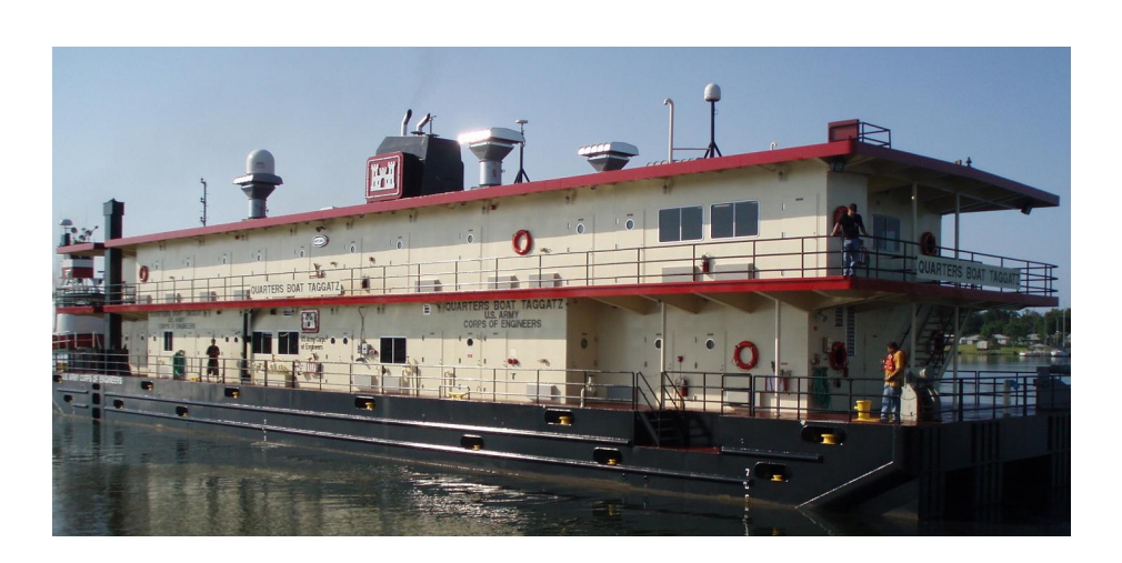
"TAGGATZ" 160' Quarters Barge 2008