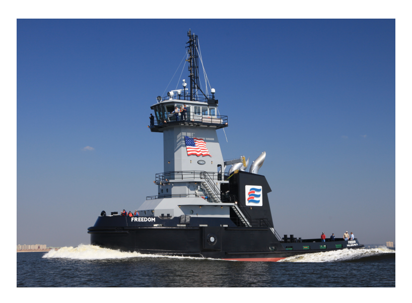
"FREEDOM" 6,000 horsepower Ocean Tug 2010